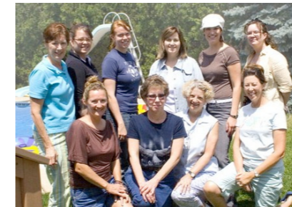
Macomb NOW Executive Board