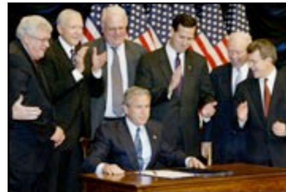
Who can forget this scene when Bush signed the abortion procedure ban?

Learn what you can do. Go to www.now.org Action Alerts.